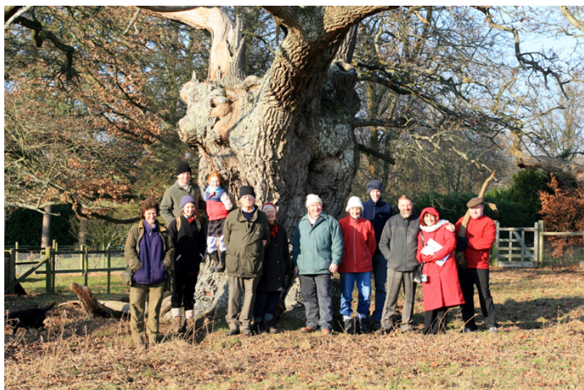
“My feet are frozen .. can we go to the pub now?!”

All the Cowdown Pollards are recorded at www.ancient-tree-hunt.org.uk , just follow the links on the WCV web site.