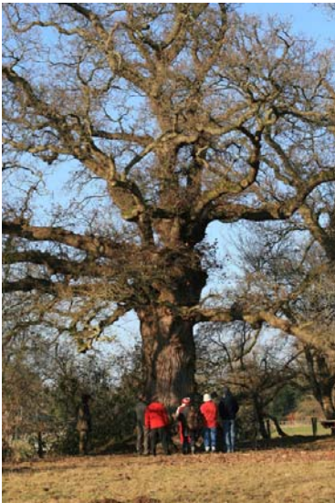
Oak Pollard No. 1 – 4.80m

In all six trees were recorded; it is peculiar that five of them stand in a straight line running south-to-north rather than being spread about, our assumption is that this formed an old boundary line. The fifth and an additional tree (and maybe one more) are inaccessible being in a private garden. The sixth and largest tree (by girth) is situated some 50 metres from the others on the bank of the river Itchen, obscured by a holly bush, and the root system of which has become exposed.