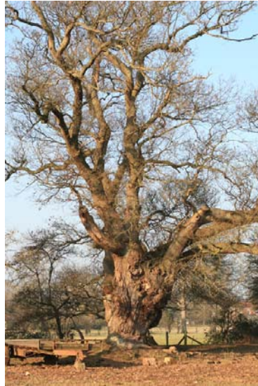
Oak Pollard No. 2 – 5.60m