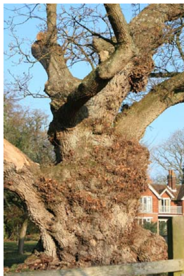
Oak Pollard No. 5 - private