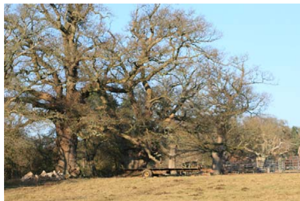
Cowdown Pollards in a line

After Christmas lunch at The Trout, Itchen Abbas, a seventh tree, a well known ancient yew at St John the Baptist church, Itchen Abbas, was also measured. We understand this tree might be recorded in a Saxon charter of 939AD, which puts it at over 1,000 years old. In the shadow of the yew is the grave of the last man to be hanged for horse stealing in England! The yew has been pollarded and a major branch has also been removed; otherwise the tree is flourishing. We measured the tree's girth at 7m 75cm.