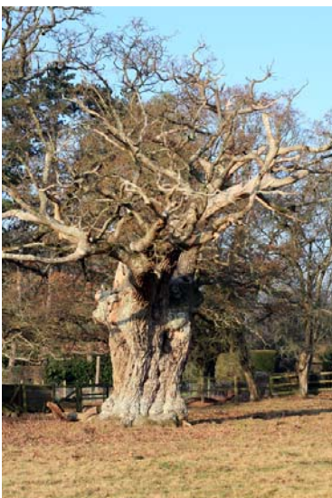
Oak Pollard No. 4 – 5.40m

It is not known when the trees were pollarded or even what use the timber would have been put to – maybe for local dwellings, or for ships down on the coast. We estimated the trees at least 400 years old, with the largest having a girth of well over 5 metres. Several have hollowed trunks and branches; recently one (no. 3) has suffered the loss of a major limb, now resting forlorn on the ground where it fell – an owl was later spotted in the hollow remain. All are still actively growing, looking graceful with their many years, except one fragile-looking tree (no. 4) but no doubt still with several more years left in it – we chose to take a group photo under this one. Whilst grazing cattle have done little visible damage, these trees would do well - and deserve - to be protected by a suitable fence.