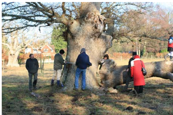
Taking measurements – the lady in red is the official recorder!