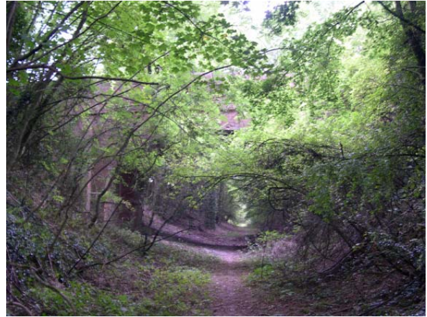
2. Bridge at Bridgetts Lane.