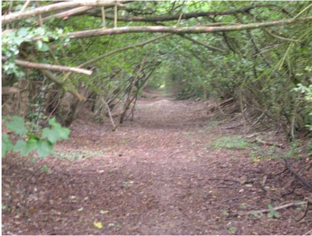
1. Path westwards.