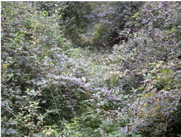
3. Thicket to dense a little after bridge.