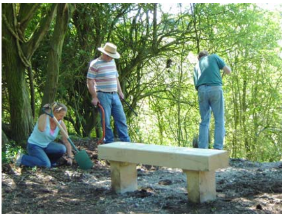
Removing saplings after the bench is complete.