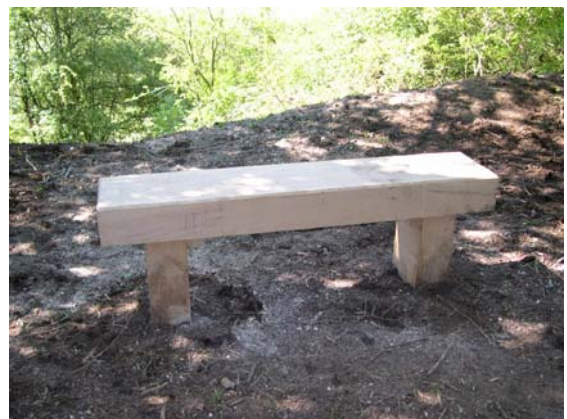
The completed oak bench, a welcome sight for travellers.