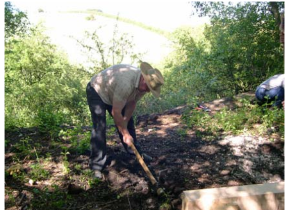
Excavating holes for the bench legs.