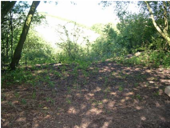
Chosen site for bench in glade.