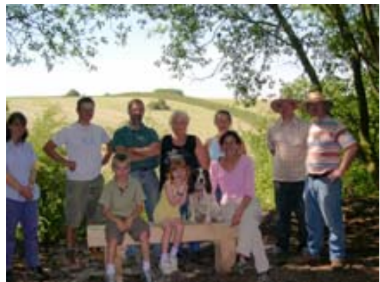
Worthy's Conservation Volunteers gather around the new bench.